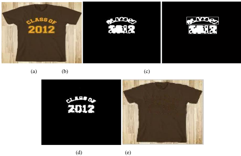
Fig. 4 Text Detection and Inpainting (a) Original image (b) Image after applying first set of criteria (c) Image after applying second set of criteria (d) Image mask (e) Inpainted image using patch size 5 x 5 and search window size 81 x 81

To eliminate small objects, connected component labelling is applied to the resultant image.(c) represents text detection by applying second set of criteria which eliminates all the objects whose area is less than 300 and filled area is less than 500.