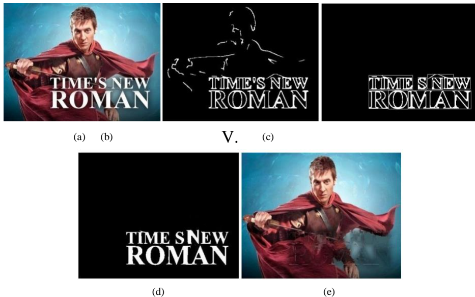
Fig. 2. Text Detection and Inpainting (a) Original image (b) Image after applying first set of criteria (c) Image after applying second set of criteria (d) Image mask (e) Inpainted image using patch size 4 x 4 and search window size 81 x 81

Figures shows the results of text detection from an image and inpainting by using exemplar based Inpainting algorithm. Figs. 2, 3, 4 (a) shows the original image. (b) is the image obtained by applying first set of criteria. All objects whose area greater than 10000 and filled area greater than 8000 are eliminated and major axis lengths are in between 20 to 3000 are considered to be text. Still, some small non-text objects are detected.